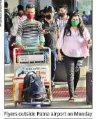
Flayers outside Patna airport on Monday