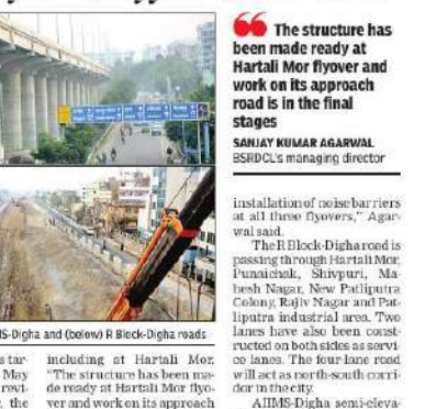
The newly constructed AIIMS Digha and R Block-Digha roads

Patna: The state government's two ambitious road projects in the state capital are set to be completed in the coming weeks. While the trial run has started on AIIMS Digha semi elevated road, the R Block Digha road is likely to be completed by December. Patna: The state government's two ambitious road projects in the state capital are set to be completed in the coming weeks. While the trial run has started on AIIMS Digha semi elevated road, the R Block Digha road is likely to be completed by December.