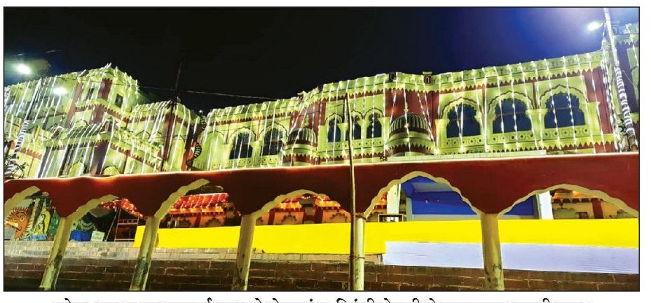
लोक आस्था का महापर्व छठ को लेकर रंग-बिरंगी रोशनी से जगमगाया काली घाट।

इसके अलावा एम्स में 11 लोगों ने कोरोना को मात दे दिया, जिन्हें अस्पताल से डिस्चार्ज कर दिया गया।